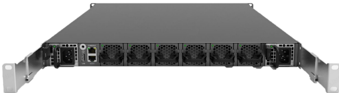
DS610 rear view